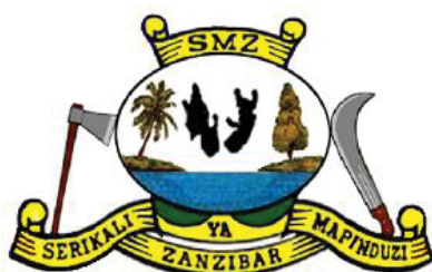
REVOLUTIONARY GOVERNMENT OF ZANZIBAR OFFICE OF INTERNAL AUDITOR GENERAL